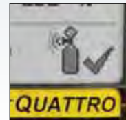
Simple, visual compliance