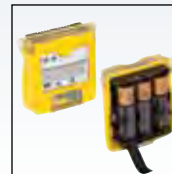
Always ready when you are