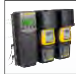
MicroDock II compatible