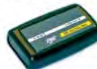
IR DATALINK USB ADAPTER