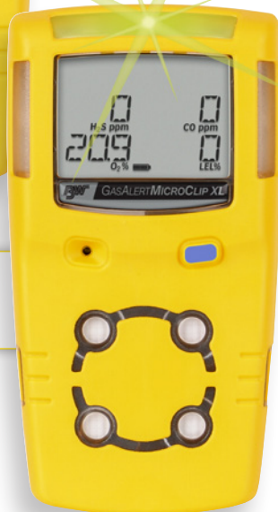
GasAlert MicroClip XL

NEW! GasAlertMicroClip Series now features IP68 for maximum water and dust protection.