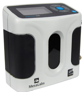
Discontinued Definer 220