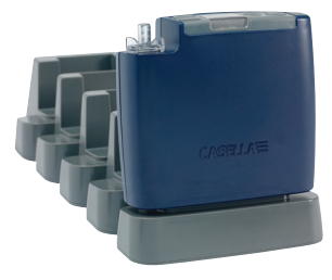
Apex2 pump with 5 way charger

Chargers: Single or 5-way Charge Time: Typically <6hrs