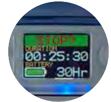
Colour coded display showing remaining battery life

Use Airwave on your mobile device to remotely monitor multiple pumps, without disturbing the wearer!