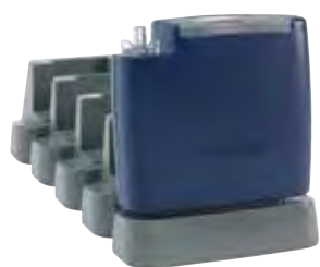
Apex2 pump with 5 way charger