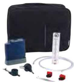
Starter Kit available to include sampling accessories