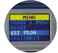
Easy to use menu