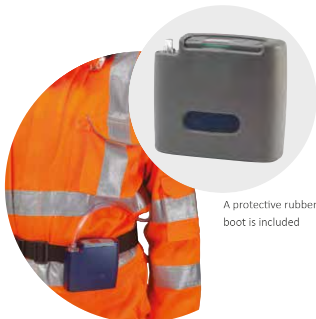
A protective rubber boot is included